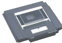
Fiche Carrier 190RII (3659A004)