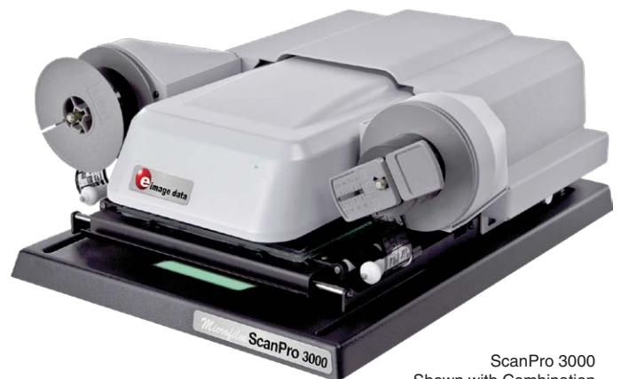
ScanPro 3000 Shown with Combination Fiche, and Motorized 16/35mm Film Carrier