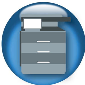
Fax Server or Multifunction Device

IOFBridge offers a middleware solution that automates the capture and delivery of files originating from office fax servers or multifunction devices that scan to network shares and FTP sites. As faxes and files are created and written to a server share, IOFBridge will watch these directories for new files, convert them to the required image format, and then release them into ApplicationXtender or other supported capture or content management solutions. Once they have been processed, the files are released into your content management system for indexing. Intelligent Capture Xcel, or ICX, by Image One can allow you to index using Zonal OCR, Barcodes, or other automated processes. This indexing and easy file transfer would allow your business to save time and effort and make the process smoother on all sides.