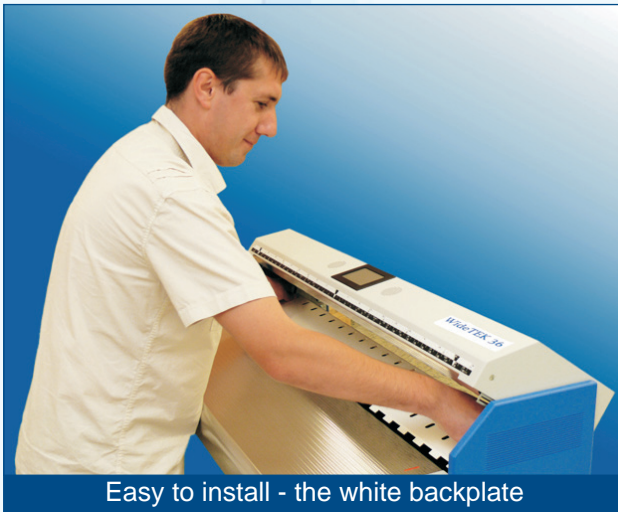
Easy to install - the white backplate

For digitization of transparent documents WideTEK large format scanner can be refitted with a white backplate. This simple and effective accessory is considerably more cost-effective than a conventional backlight unit.