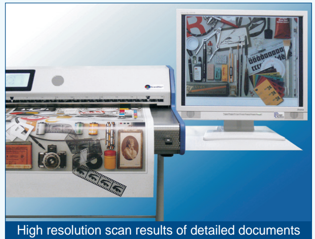
High resolution scan results of detailed documents

With a life expectancy of over one million scans, the WideTEK 36 redefines the price/performance ratio in the wide format scanner market.