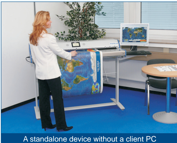
A standalone device without a client PC

The user operates the scanner either with a standard internet browser or alternatively, via the built-in touch screen. A monitor directly connected to the scanner can be used for image control or to modify the scan parameters, without a client PC. Using the touch screen display, up to 30 different password protected jobs can be defined and stored. The jobs contain preconfigured settings such as scan parameters or directories on the network drives.