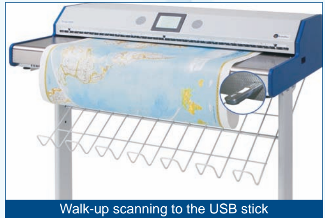
Walk-up scanning to the USB stick

The cutting edge camera technology, consisting of a dust-protected, hermetically sealed camera box holding CCD systems using a patented stitching procedure, delivers an optical resolution of 1200 x 600 dpi.