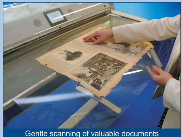
Gentle scanning of valuable documents

Automatic document size recognition allows operators to pass sensitive documents through the middle of the scan area, protecting documents from any damage.