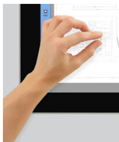
Touchscreen Full HD 21.5" touchscreen